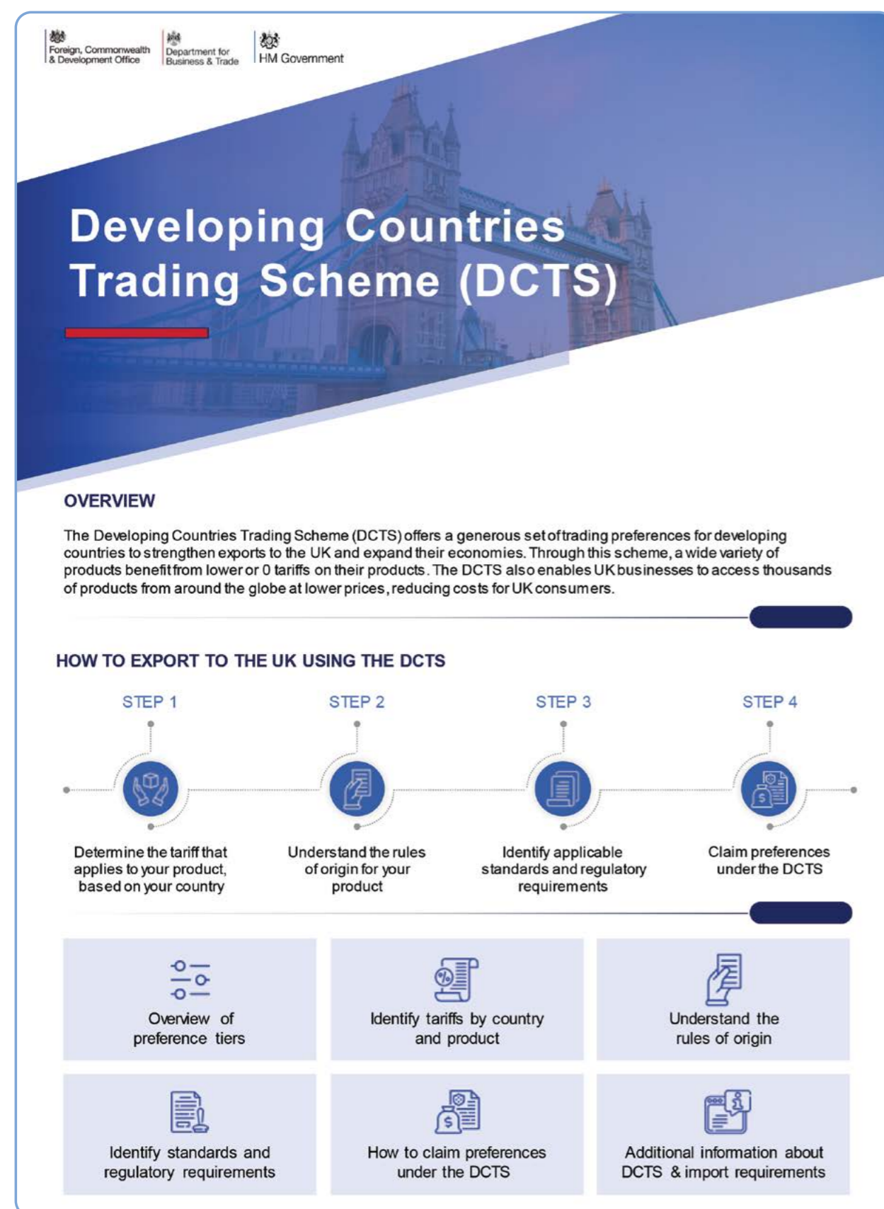
Figure 1: Overview of the United Kingdom Developing Countries Trading Scheme